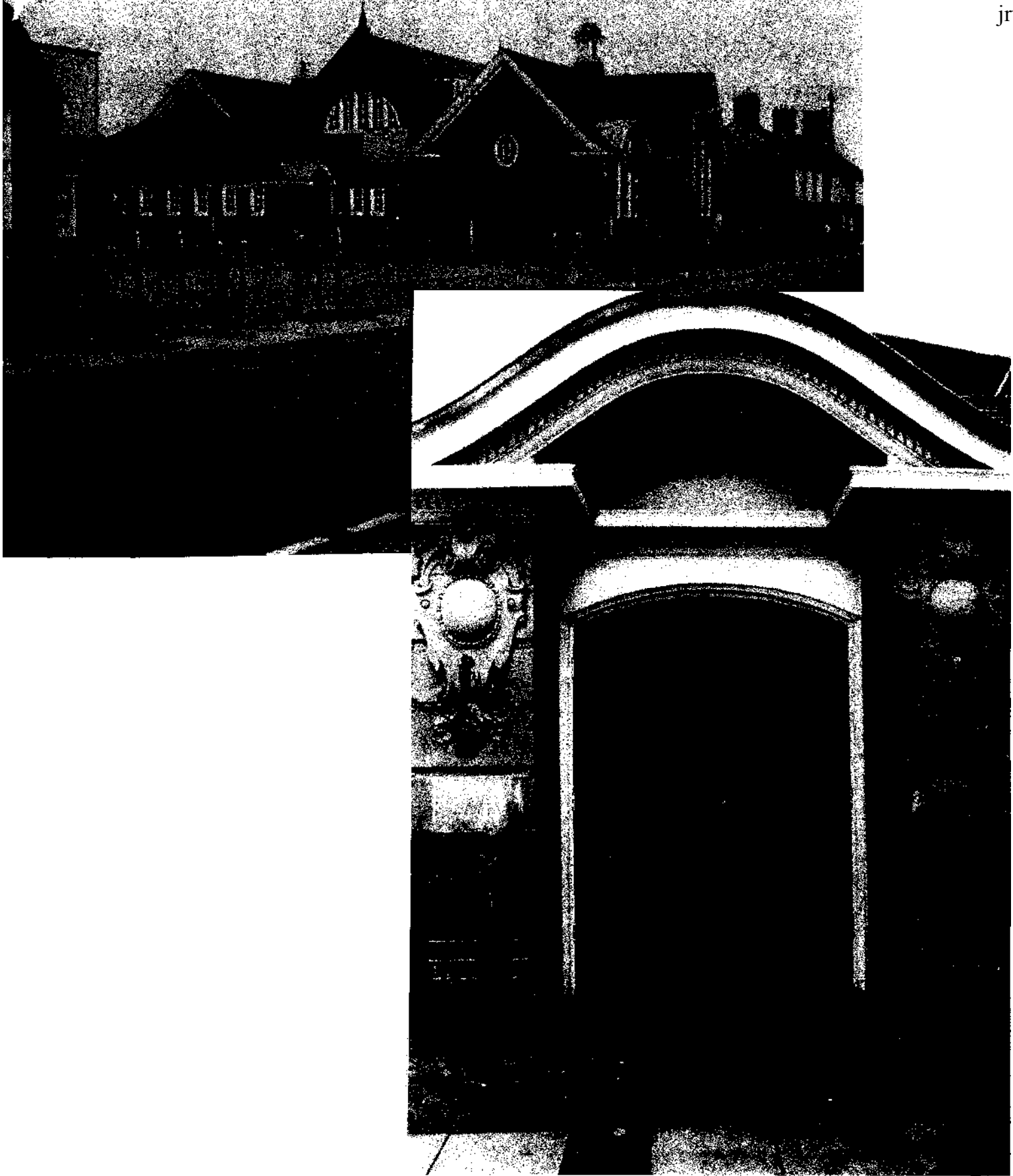
Top: The Girls' School (1904) with Infants' part visible on left. Bottom: The handsome doorway of the Girls' School, now the Bassett Community Centre.